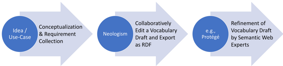
Fig. 1. The vocabulary drafting process embedded into a typical user workflow.

experts but overwhelming for users with little to no knowledge about ontologies. As in the comparison with Neologism 1.0, we argue in general that a graphical editor provides strong benefits over text-based editors, particularly for naïve users. Tools like WebVOWL do support graph-based editing, but miss features such as real-time collaboration or publishing ontologies. Additionally, managing and maintaining ontologies in Neologism 2.0 is kept very simple, so that creators can manage access rights to the ontology quite easy and can publish ontologies by themselves. Neologism 2.0 does not focus on only one feature, but combines multiple features, while simplifying them to assist rapid vocabulary creation. We see Neologism 2.0 as proposal to fill the gap between simple sketches and fully-fledged ontology editors, and aim for a strong integration with state-of-the-art tools.