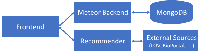
Fig. 2. Neologism 2.0’s frontend communicates with a backend to persist information, and might interact with a recommender to improve the quality of drafted vocabularies.

REST endpoints for edit operations on classes and properties. As a major feature, Neologism 2.0 immediately synchronizes changes among all clients and the server to enable real-time collaboration, which avoids confusion among users caused by asynchronous edits.