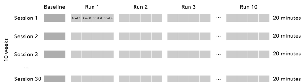
Fig. 1 Schematic representation of the neurofeedback intervention. Approximately 3 sessions of neurofeedback were provided in a week, with 30 sessions taking 10 weeks. Each neurofeedback session started with a 1-min theta/beta baseline recording, which was used for the remaining of the session. A session consisted of 10 runs of 2 min each (20 min effective training). Each run comprised 4 trials of 30 s. Children were instructed to decrease theta/beta compared to the baseline recording during each trial. Children were rewarded with cred-

In more detail, theta/beta training was applied unidirectionally, with the aim to inhibit theta (4–8 Hz) and reinforce beta (13–20 Hz) activity at Cz. The THERAPRAX ® EEG Biofeedback system (Neuroconn GmbH, Germany) with a DC-amplifier and a sampling rate of 128 Hz was used to transmit and analyze the EEG signal. Reference and ground electrodes were attached to right and left mastoids, respectively. Electro-oculogram (EOG) was obtained with two electrodes at external canthi, and two electrodes at infra- and supra-orbital sides. Ocular correction was applied as described in Schlegelmilch et al. [29]. Subsequently, theta/beta index [ \text{theta}(\mu\text{V}^2/\text{Hz}) - \text{beta}(\mu\text{V}^2/\text{Hz}) / \text{theta}(\mu\text{V}^2/\text{Hz}) + \text{beta}(\mu\text{V}^2/\text{Hz}) ] was computed with a