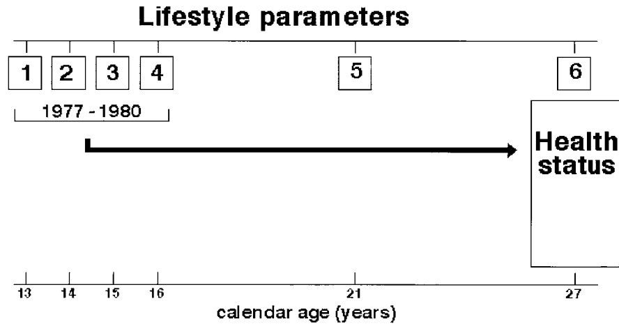
Fig. 1 Relationship between health status measured at adult age (i.e. at the age of 27 years) and lifestyle parameters measured during adolescence (i.e. at age 13–16 years)

the analyses reviewed here the daily intake of the following nutrients was calculated: (1) the intake of saturated fat (SFA), expressed as energy percentage; (2) the intake of poly unsaturated fat (PUFA), expressed as energy percentage; (3) the ratio between the absolute intakes of PUFA and SFA (P:S ratio); (4) the intake of carbohydrates, expressed as energy percentage and; (5) the intake of cholesterol (Chol), expressed in mg/mJ.