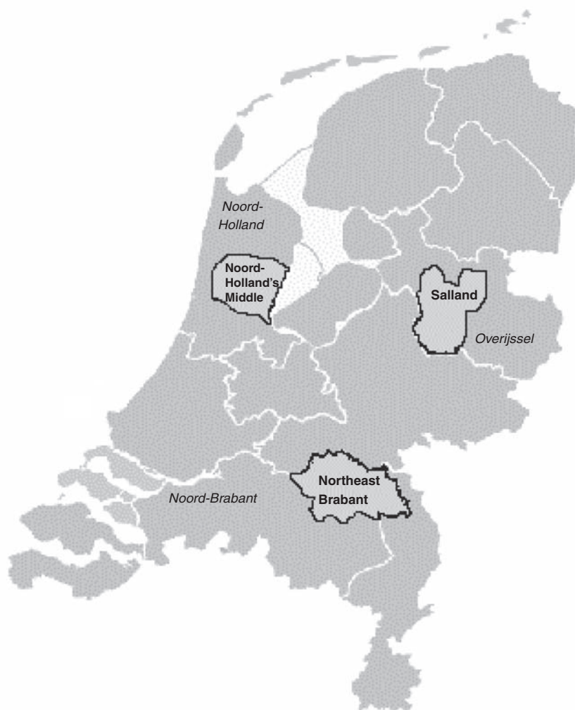
Figure 1. Location of the Three Regions in the Netherlands

high proportions of never married. Marital fertility in Noord-Brabant was higher than anywhere else in the Netherlands during the nineteenth century. 25