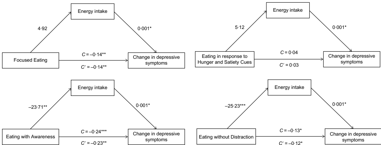
Fig. 3 Mediation models of the associations between four mindful eating domains and 3-year change in depressive symptoms via diet quantity (total energy intake; kcal/d; 1 kcal = 4.184 kJ) in a sample of people aged 55 years or above from the Longitudinal Aging Study Amsterdam ( n 929). Unstandardized regression coefficients from a bootstrap procedure with 5000 samples are provided along the paths. Analyses are adjusted for baseline depressive symptoms, sex, age, educational level, smoking status, physical activity level and alcohol consumption (model 3). C , total effect; C' , direct effect; * P < 0.05, ** P < 0.01, *** P < 0.001