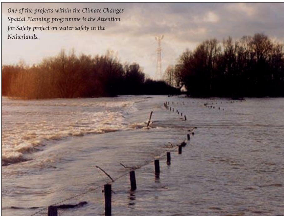
One of the projects within the Climate Changes Spatial Planning programme is the Attention for Safety project on water safety in the Netherlands.

The G-scenario is based on a temperature rise of 1 degree Celsius between 1990 and 2050. This corresponds with the B2-scenario in the WLO-study. The size of the population remains roughly the same (16 million in 2040), there is a slight increase in economic growth and unemployment rate is high. Trade blockades are