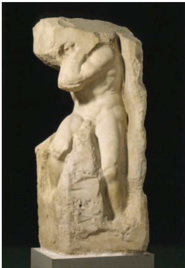
Fig. 1. Unfinished “captive” by Michelangelo Buonarroti.

Is such adaptation a good thing or a bad thing? The concept of partner affirmation describes whether the partner is an ally, neutral party, or foe in individual goal pursuits (Drigotas et al., 1999). As noted in Figure 2, affirmation has two components: Partner perceptual affirmation describes the extent to which a partner consciously or unconsciously perceives the target in ways that are compatible with the target’s ideal self. For example, John may deliberately consider the character of Mary’s ideal self, consciously developing benevolent interpretations of disparities between her actual self and ideal self. Alternatively, if John and Mary possess similar life goals or values, John may rather automatically perceive and display faith in Mary’s ideal goal pursuits.