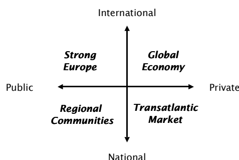
Figure 1 The four WLO scenarios.

The Future of the Dutch Natural and Built Environment (WLO) is the most recent and elaborate socio-economic scenario study in the Netherlands. It assesses the long-term effects of current government policy, given the international economic and demographic context of the Netherlands (WLO, 2006). By exploring how land use and various aspects of the living environment may develop on the long run (2040), the study shows when current policy objectives may come under pressure, and which new issues may emerge. The study builds on earlier work by CPB in which the scenarios were translated into development paths for the Dutch economy and demography. In WLO, these scenarios were elaborated for application to the built and natural environment. The four WLO scenarios are shown in Figure 1.