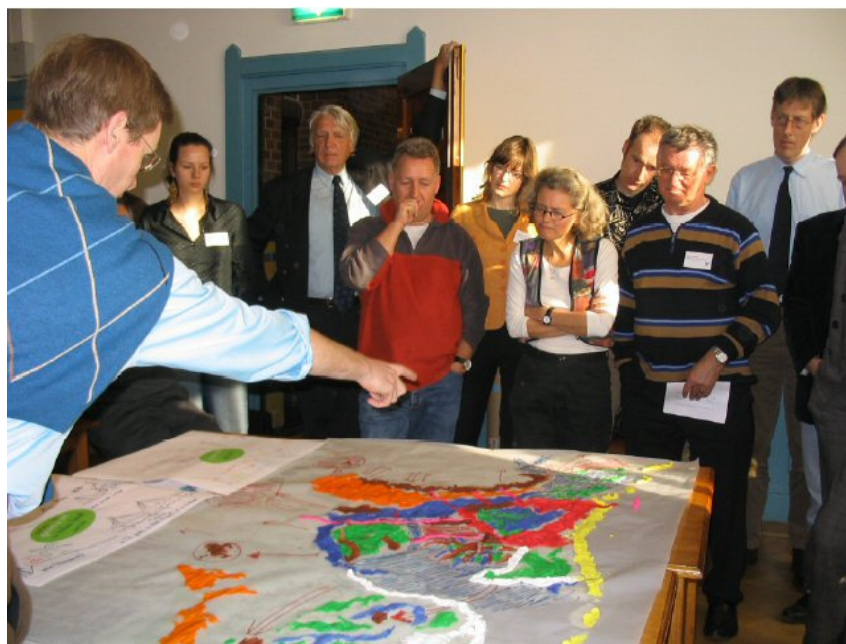
Figure 4 Determining future images with a map and coloured clay.