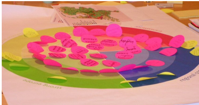
Figure 3 Maps, graphs and post-it memos were used to help the workshop participants expressing their visions.

Therefore, AVV organized four additional workshops. In two backcasting workshops (Van de Kerkhof et al., 2007) it was identified what activities are required to reach a climate proof Netherlands in 2100. The 'interdisciplinary' workshop developed discontinuous storylines by identifying and systematically evaluating the direct and indirect effects of extreme events (Van 't Klooster, 2007b). The participants used maps, clay, paper sheets, post-it memos and marker pens to visualize their insights (Figure 3 and Figure 4). The 'governance' workshop, attended by policymakers and researchers, started with two extreme future perspectives and subsequent water management options to prevent flooding. Key question that was addressed was how to identify the necessary policies, institutional changes, new roles for stakeholders etc. (Van 't Klooster et al, 2007).