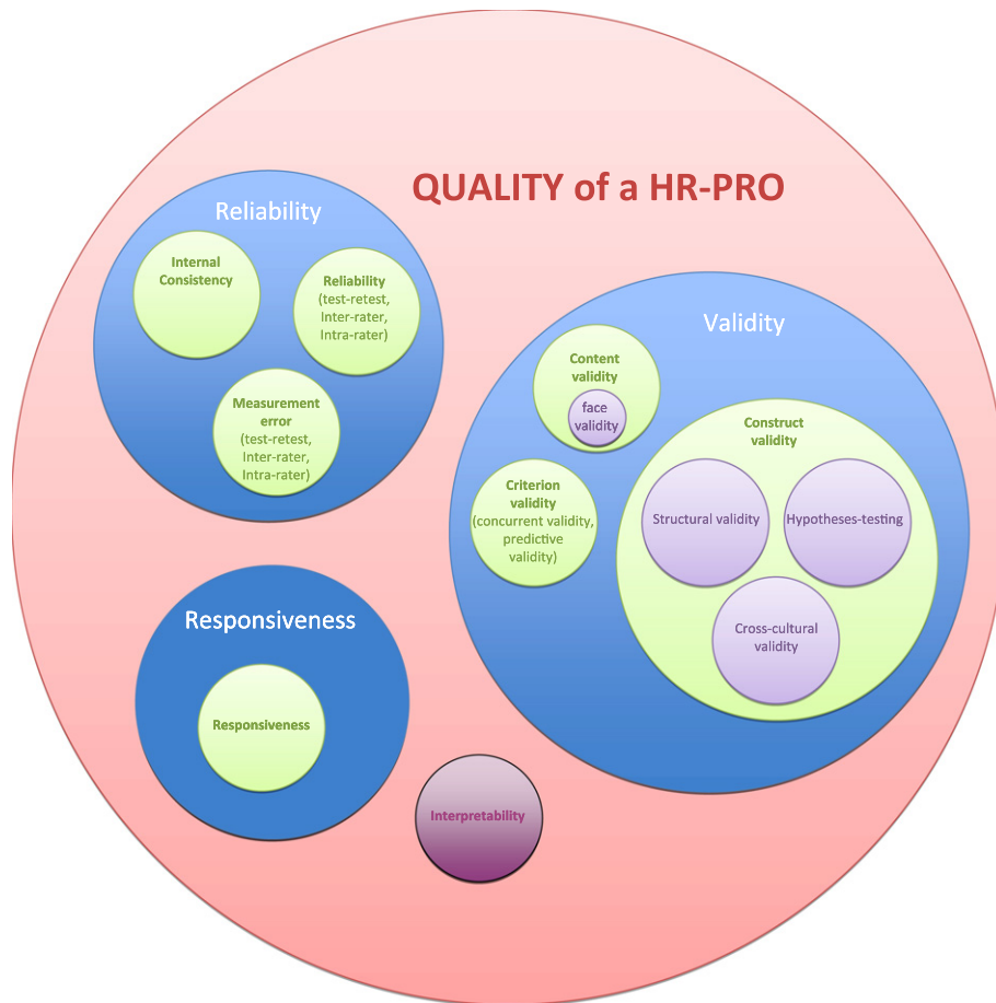
Fig. 2. COSMIN taxonomy of relationships of measurement properties. Abbreviations: COSMIN, COnsensus-based Standards for the selection of health Measurement INstruments; HR-PRO, health related-patient reported outcome.

In the domain validity, we distinguished between the measurement properties content validity, construct validity, and criterion validity. Although important authors in the field of psychology have called all types of validity construct validity [8–10], we explicitly decided not to do so (77% agreement) because at the level of design and methods, these three forms of validity differ. Furthermore, we distinguished three aspects of construct validity, that is, structural validity, hypotheses testing, and cross-cultural validity (76% agreement). Because many different hypotheses can be tested which require various designs, hypotheses testing includes, for example, convergent, discriminant, and known groups validity. We explicitly distinguish these three aspects of construct validity for several reasons: