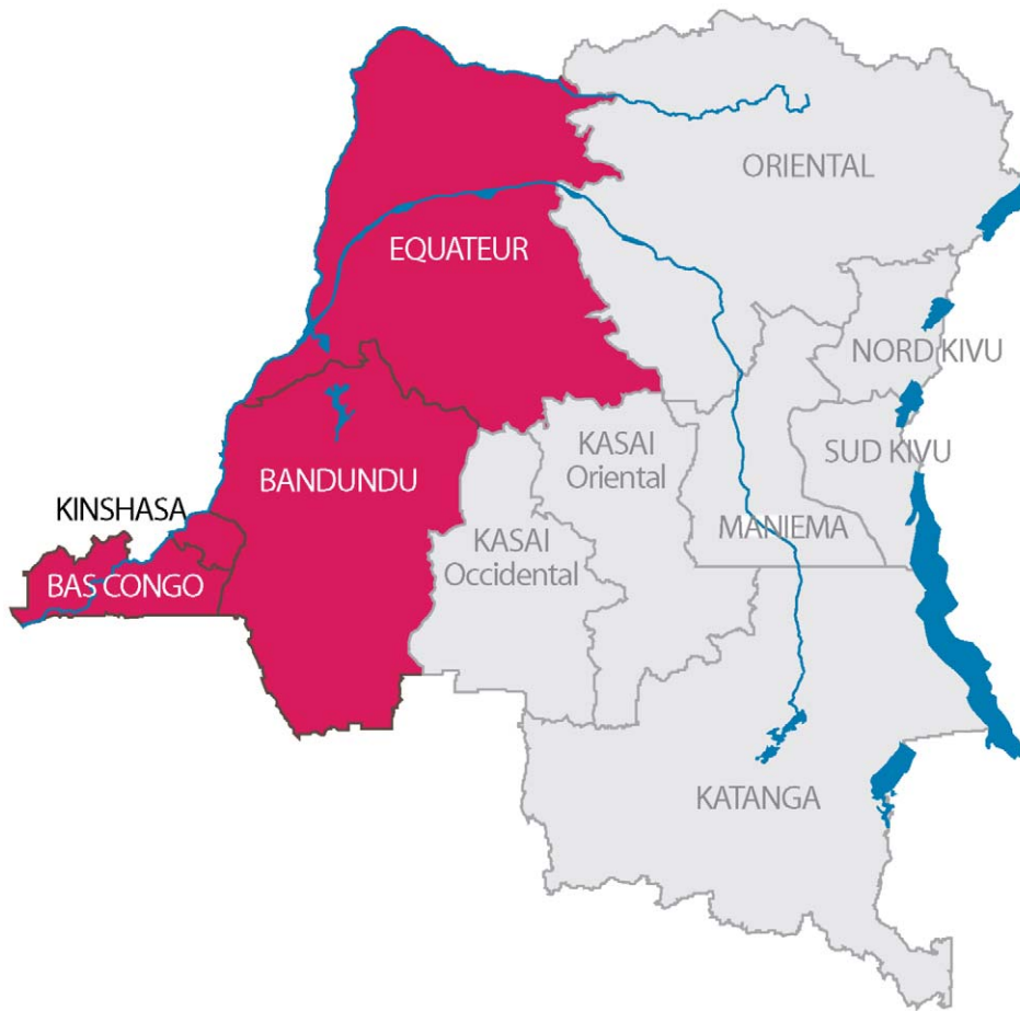
Figure 1. Origins of the pigs included in the market study. doi:10.1371/journal.pntd.0000817.g001

temperature, centrifuged, and serum was collected. Serum was stored at -20^{\circ}\text{C} until analysis and later tested with the ELISA for the detection of circulating antigen of the larval stage of T. solium (antigen ELISA, [20]), which enables the detection of active infections (presence of viable cysts).