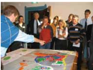
Figure 4. Determining future images with a map and coloured clay.

The AVV-DOS challenges the user to ‘play’ with the available information. Hence, he will develop some sensitivity for the key parameters in the system and their implication on the water safety in the Netherlands.