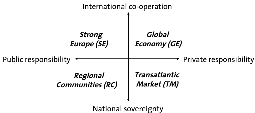
Figure 1. The four WLO scenarios.

The Future of the Dutch Natural and Built Environment (WLO) is the most recent and elaborate socio-economic scenario study in the Netherlands. It assesses the long-term effects of current government policy, given the international economic and demographic context of the Netherlands (WLO, 2006). By exploring how land use and various aspects of the living environment may develop on the long run (2040), the study shows when current policy objectives may come under pressure, and which new issues may emerge. The study builds on earlier work by CPB in which the scenarios were translated into development paths for the Dutch economy and demography. In WLO, these scenarios were elaborated for application to the built and natural environment. The four WLO scenarios are shown in Figure 1.