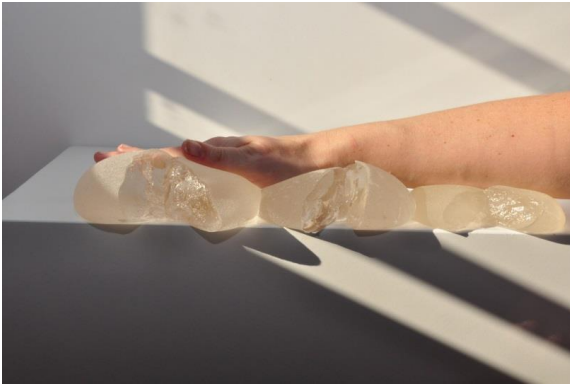
Figure 2. Three last-generation silicone breast implants, with a Poly Implant Prothèse implant between two McGhan implants.

Silicone breast implants come in many generations. The second generation was found to have a higher prevalence of rupture, than the first and third generations. The third generation was made in an attempt to create a more cohesive silicone gel but felt less natural. In Europe, the most recent generation of “form stable” single-lumen enhanced cohesive silicone gel implants became available in the mid-1990s. 9-11 The highly cohesive silicone gel fillers have been replaced by moderately less cohesive gel and less cross-linking, in an attempt to prevent capsular contraction and to maintain a softer and more natural feel 9 . The Poly Implant Prothèse silicone implant is one of these newer implants and the cohesive silicone gel implant was advertised to have a strong elastomer shell containing the Poly Implant Prothèse silicone gel, which was soft, able to retain memory, and would not leech away from the shell, even when cut in half.