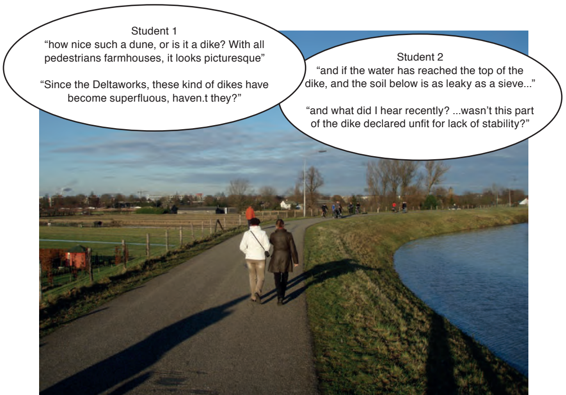
Figure 6.2 Students' intuitive and analytical thoughts when observing a dike (fictional).

The quotation from Schama's book 'Landscape and memory' is in accordance with the constructivist approach. The way people perceive a landscape in general or a dike in particular 'is the work of the mind'. One of the main questions of this thesis has to do with the mental processes underlying flood-risk perception.