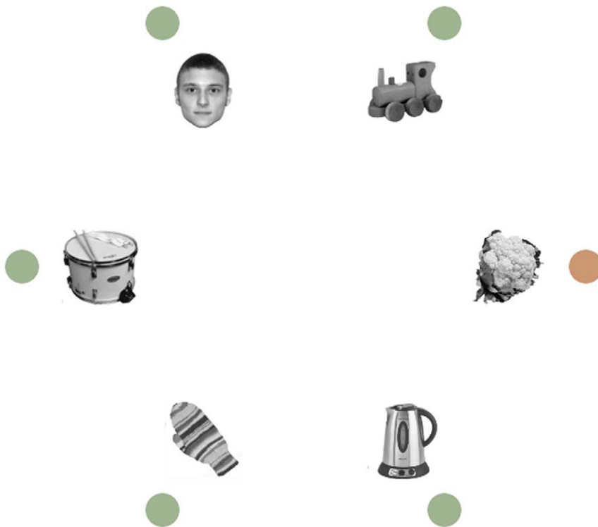
Figure 1. Illustration of a display used in the present study. Participants were instructed to make a saccade to a unique colored target circle and ignore the pictures of objects. Here, an upright face is presented as critical object and its spatial location mismatches that of the target (orange circle).