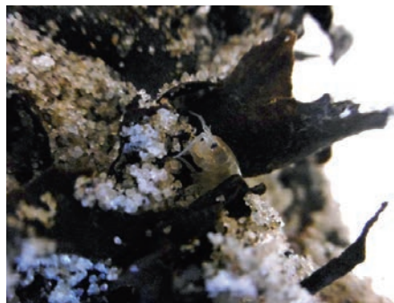
Figure 1.2 An individual of the macroinvertebrate species Scolelepis squamata from the intertidal zone (left) and Talitrus saltator from the supratidal zone (right).