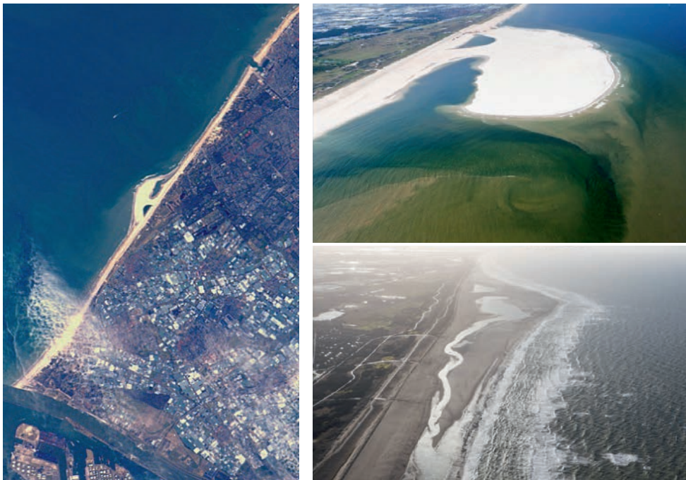
Figure 1.3 Aerial pictures of the Sand Motor mega-nourishment along the Dutch coast. Left: Overall shape of the Sand Motor mega-nourishment, protruding from the relatively straight Dutch coast line into the sea. Upper right: Sand Motor mega-nourishment shortly after completion in July 2011. Lower right: Sand Motor mega-nourishment four years after completion in January 2015.

Sand nourishment can be viewed as a significant disturbance to the sandy beach ecosystem with various effects on its ecological communities (Speybroeck et al. 2006). As mentioned earlier, one direct effect is the burial and local extinction of ecological communities during application of the sand nourishment (Speybroeck et al. 2006, Schlacher et al. 2012). The same holds for a mega-nourishment, which may even have a larger initial impact on macroinvertebrate communities due to its large size. However, as the frequency of nourishment is much lower and along shore beaches are gradually nourished by the mega-nourishment, potentially limiting disturbance by sand deposition, it may finally have a lower combined impact on the macroinvertebrate community compared to regular beach and foreshore nourishment. Therefore, I will focus here on the potential effects of a mega-nourishment on the macroinvertebrate community after completion of sand deposition. Effects on macroinvertebrate community assembly processes can be both direct (change in habitat characteristics) and indirect (change in dispersal and food availability; Figure 1.4). After completion, the mega-nourishment itself will, as is the case with regular beach nourishments, initially provide a new beach that can be recolonised by organisms. Recovery by recolonisation can be assumed to be completed when the disturbed community is no longer significantly