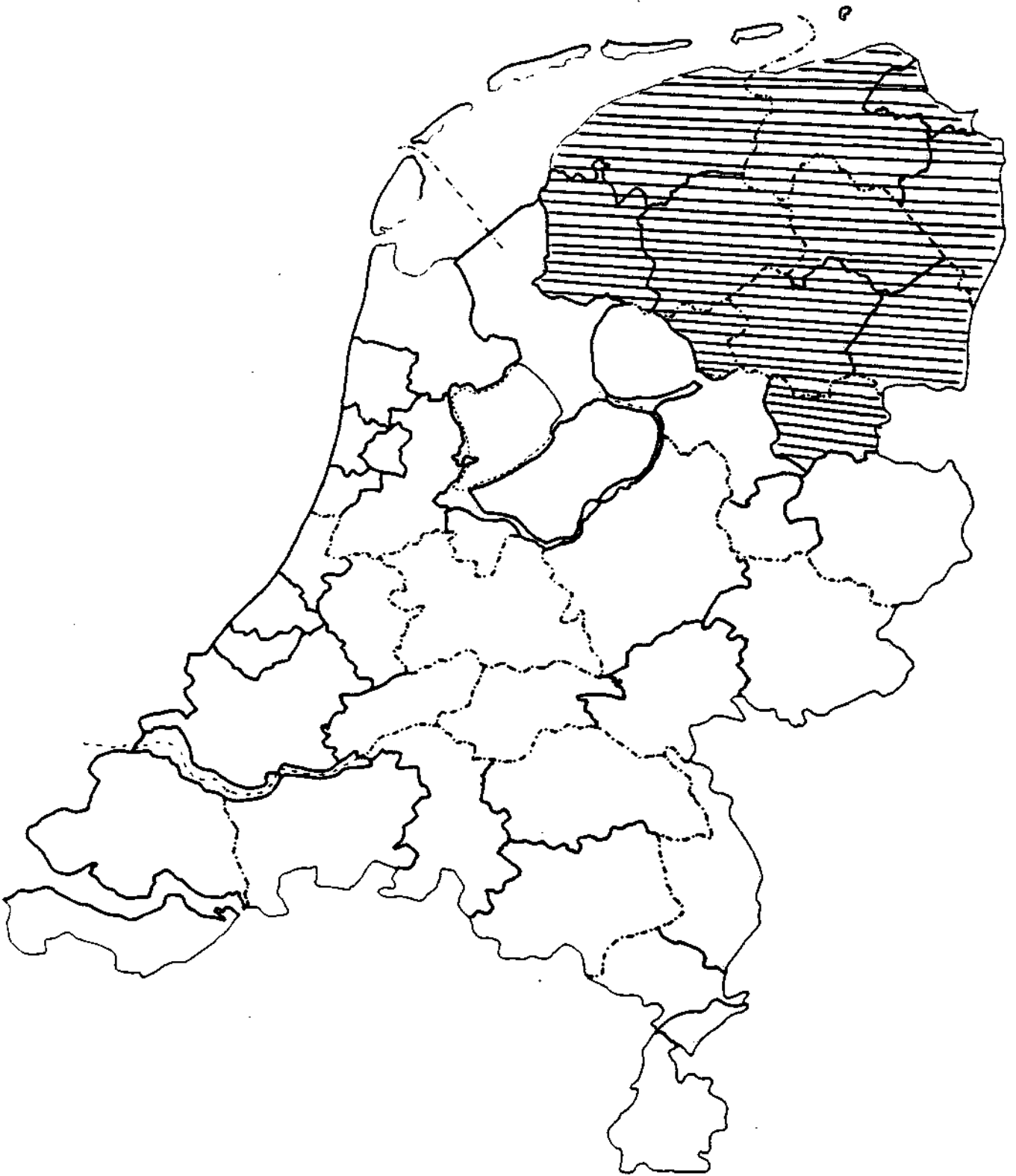
Figure 2. Area under study (shaded).