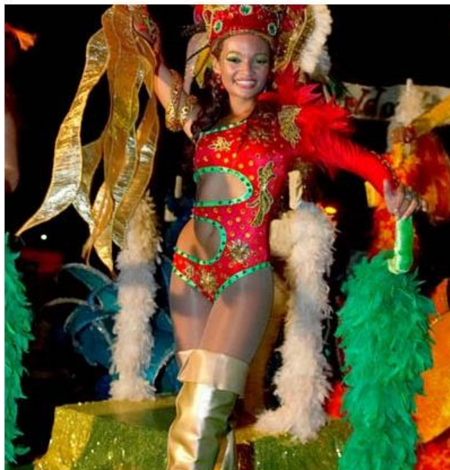
Illustration 9 Spanish language online tourism website news article promoting Aruban carnival by means of calypso (Jan 29, 2014) 53

29 de Enero 2014 | Categoría: Internacional