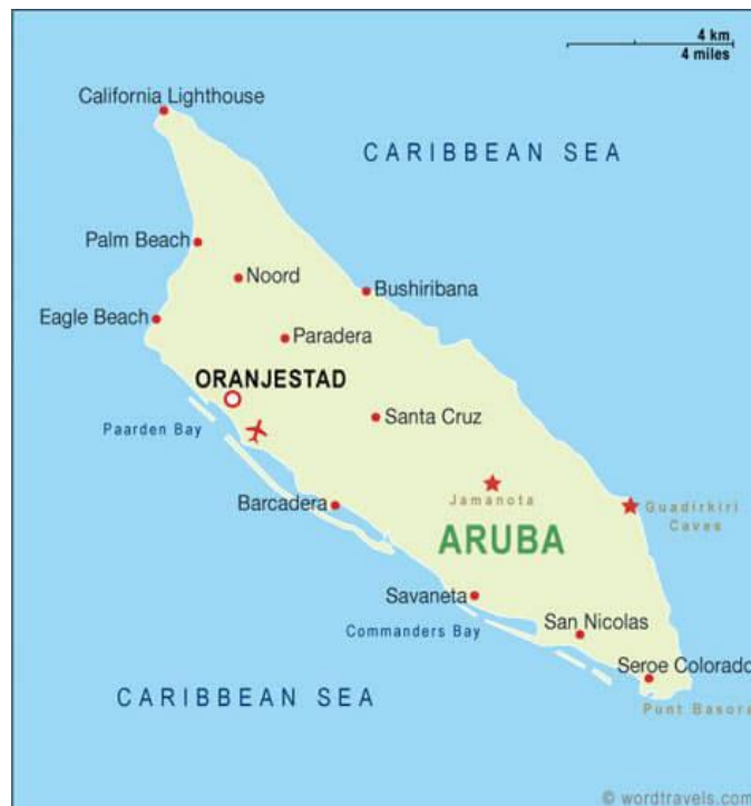
Illustration 2 Map of Aruba and its districts

The aim is to provide a foundation for understanding the rest of the dissertation; especially the role of the calypsonian and my role as a local ethnographer.