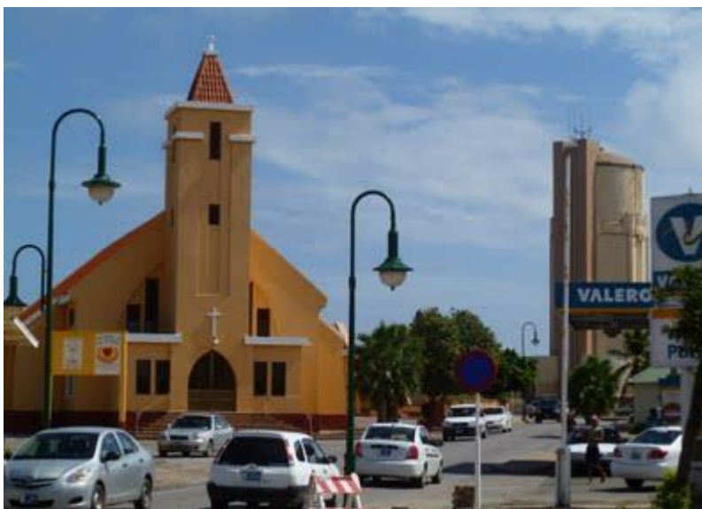
Illustration 5 Downtown San Nicolas 2011

As you enter the city of San Nicolas, what undoubtedly catches the eye are the towering chimneys of the oil refinery spewing out a grayish-whitish smoke. The skyline resembled an island version of old industrial cities such as Birmingham, or Liverpool UK and Pittsburgh, USA. The high winds coming from the North-East blow gasses emitted from those chimneys to the southern coast. On days when the wind settles, the entire San Nicolas is filled with smog. On such days, schools in San Nicolas let their students out early and people try to avoid being outside. As a teacher in San Nicolas, many times I have had this experience and have been quite critical how often it occurs. I have even attempted to organize a walkout as a signal to the refinery and the government that we could no longer accept this situation. My proposition was met with skepticism. One student told me, ‘we need the refinery, even though it making we sick, my mother and father work there.... If it was not for that refinery, I would not have any food to eat’ .