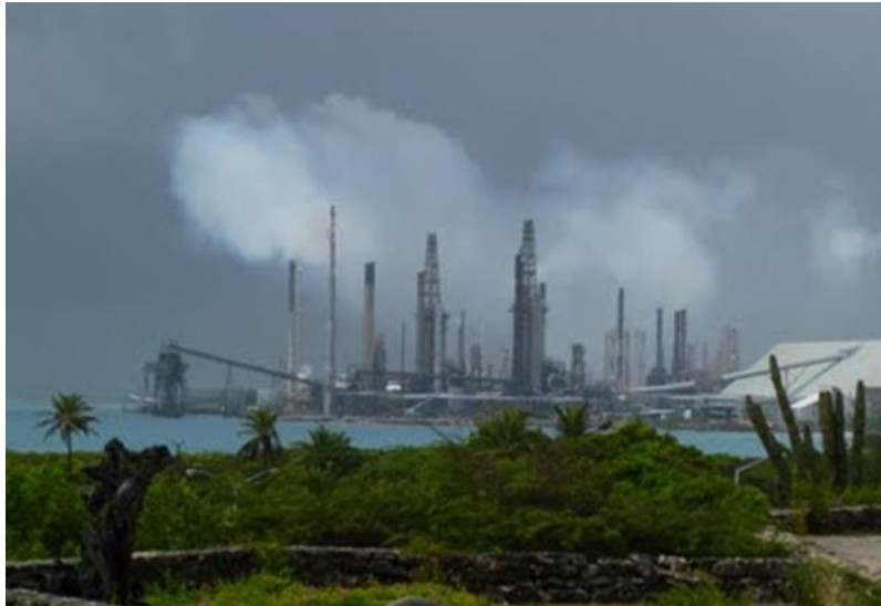
Illustration 6 Oil Refinery in Aruba