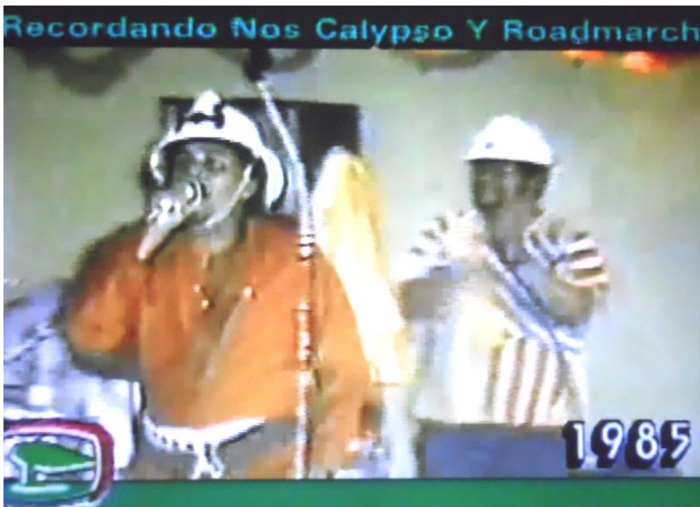
Illustration 20: Mighty Cliff during his Road on Fire Performance 1985