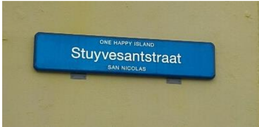
Figure 1 Street name board in San Nicolas Aruba

This illustration below along with some other observations may provide a better context of some of the ways I have observed, some of the Narratives of the One Happy Island play out in the public sphere.