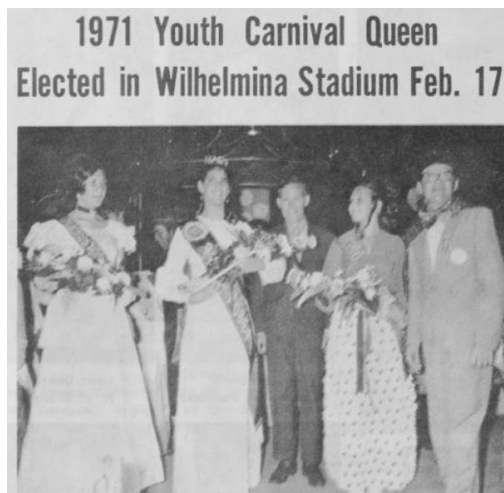
Illustration 13 Esso News photo of the 1971 youth queen election in the Wilhelmina Stadium

At this juncture, I will provide some calypso texts to exemplify some of the phenomena discussed above. I will not go into much detail here, but instead I will attempt to bring home to the reader what the general feeling amongst many calypsonians was like.