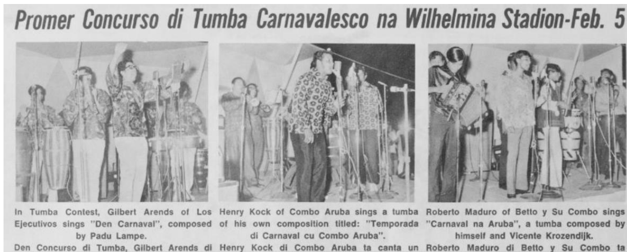
Illustration 12 Esso News article and photos of the First Tumba contest in Aruba at the Wilhelmina Stadium 1971

Another gripe of the calypsonians during the 80s were what they felt was the special attention the Reina di carnival concursos [carnival queen pageants] were getting. Their main complaint was that these 'clear complexioned' queens, would get cars and other fancy gifts as their winnings yet calypsonians would receive nothing in prize money. Similar examples can be found in Latin America, in countries such as Colombia, Venezuela, Ecuador and Brazil where a considerable part of the population is of African descent yet are not represented in beauty contests, in magazines and as news anchors. 55 Below is an illustration of the 1971 youth carnival queen election, also held in the Wilhelmina stadium in Oranjestad.