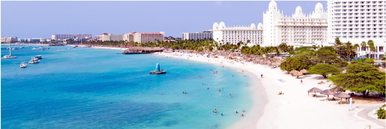
Illustration 4 Aruba Palm Beach

Pariba consists of the barrios Pos Chiquito, Savaneta, Brazil, San Nicolas and others, but in everyday talk, Arubans usually mean San Nicolas. San Nicolas is also known in the community as Chocolate City, a term used by locals in reference to its darker complexioned inhabitants, in contrast to the lighter complexioned Arubans living in the other barrios of the island. From my experience one's interpretation of this concept usually lies in the expression, intonation and the intent. For example; fans of the concept Chocolate City say that chocolate is 'edible', 'sweet' and a little 'bitter'. They say chocolate has 'soul', it has 'rhythm' and chocolate has a bite to it. Fans of Chocolate City say that chocolate does not refer to darker complexions only, it's a whole concept on its own that encompasses a wide range of ideas, colors, attitudes, walks, talks, looks and an array of multiple expressions.