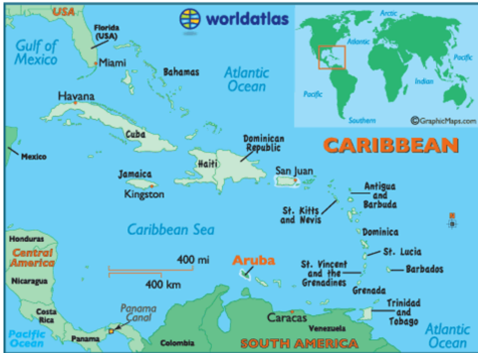
Illustration 1 Aruba in the South Caribbean Sea