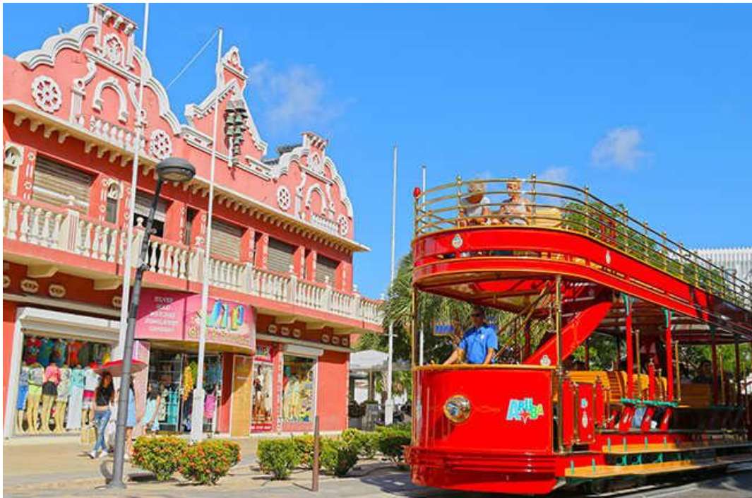
Illustration 3 Tram Carrying cruise passengers in Oranjestad

A bit further to the North near the crystal blue waters and pearly white sands of Palm Beach lies a strip of seemingly endless 5-star hotels which is also referred to as pabou . This area is a cardboard cutout of Miami Beach as it was modeled after this area's long stretches of beach adorned with palm trees, restaurants, nightclubs, gigantic mansions and perfectly paved roads. Everything is geared towards the American tourist market and the upper class Anti-Chavista tourists from neighboring Venezuela. The narrative in the tourist industry is that European tourists, mainly from the Netherlands, would rather vacation on the Dutch Caribbean sister island of Curaçao because they say it seems more 'authentic'. Some say that Aruba is fake and cultureless. A joking response by many Arubans would be, 'we don't give a damn about these types of criticisms, we are Americanized and we love it!'