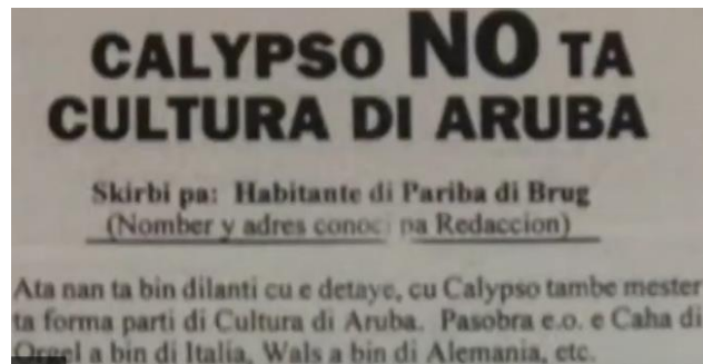
Illustration 10 Diario newspaper opinion piece (early 2000s)

[Calypso is not part of Aruba's culture]